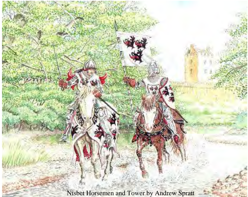
Nisbet Horsemen and Tower